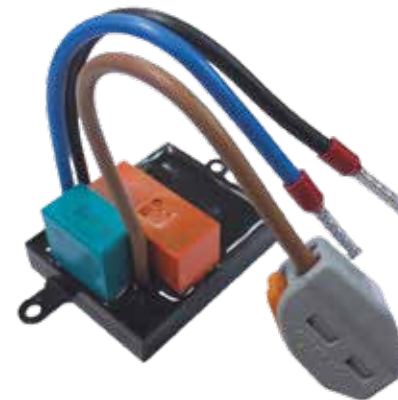
Part No. 4150114 Built-in relay, radio