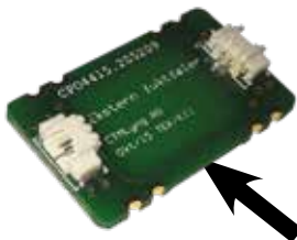
Tape on the underside.

Position where moisture can occur that you want to detect.